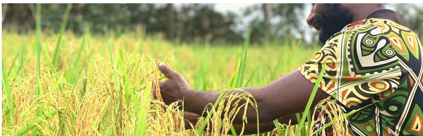
Smallholder family rice farming, Sepik Plains, Yangoru Saussia District