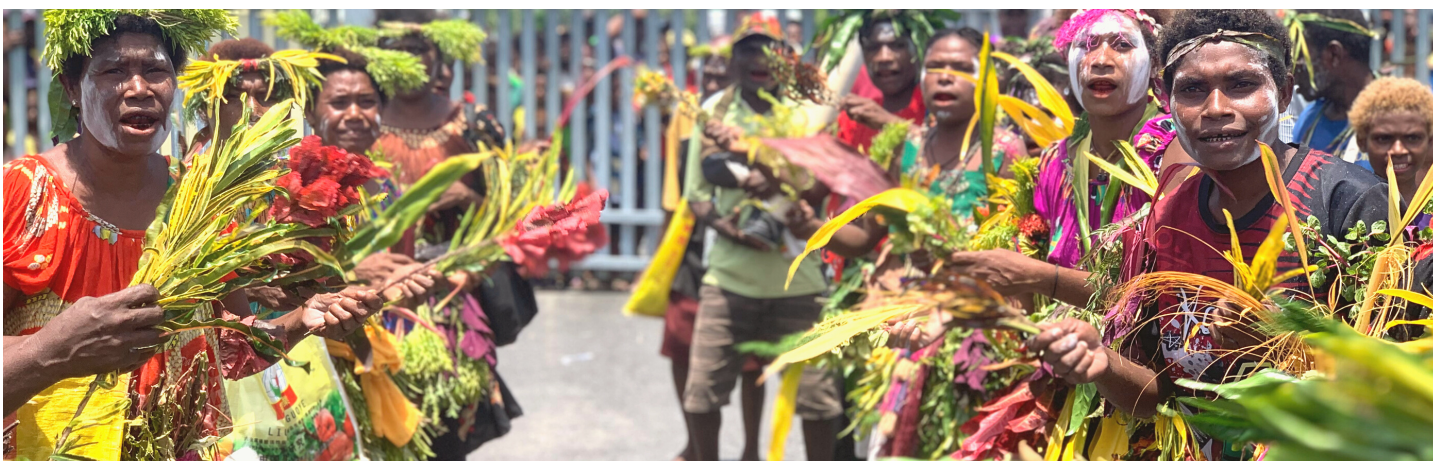
Women from Nakanai, West New Britain, joining our #PeopleFirst movement

PFP will empower and partner with Churches and Faith-Based Organizations to implement our key policies. Churches play a critical role in development, and step in where Government services cannot reach the people.