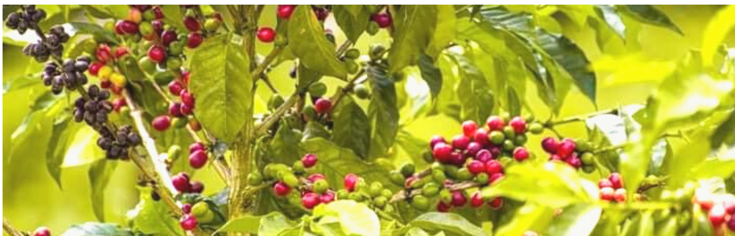
Coffee - the backbone of Highlands economy