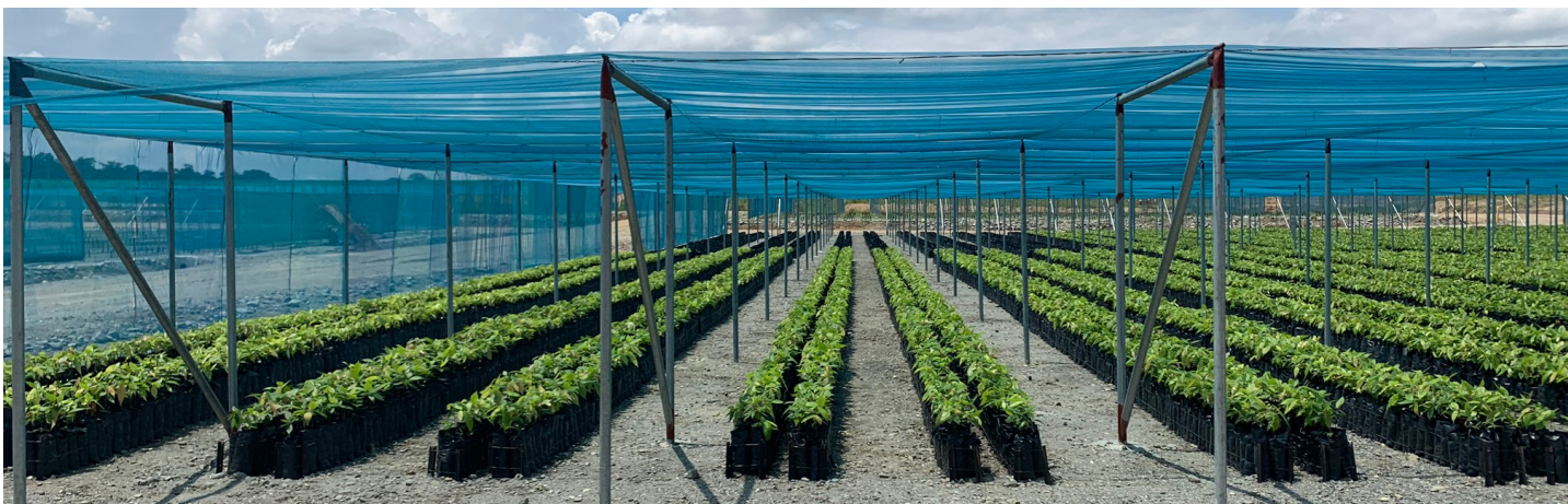
Cocoa Nursery at Huaripmo, Sepik Plains, Yangoru Saussia District

The recent Covid19 pandemic's disruption has also opened new doors of opportunities for our political party to prioritize policies that are people-focused and that which enhances resilience and sustainability of our economy to shocks.