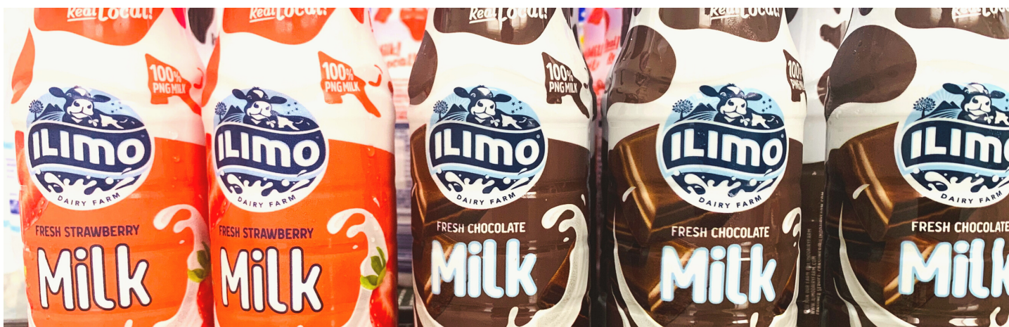
Locally-produced milk by Ilimo Dairy Farm