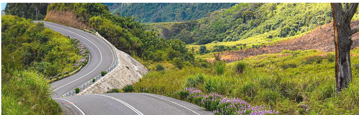
Tambul-Mendi backroad