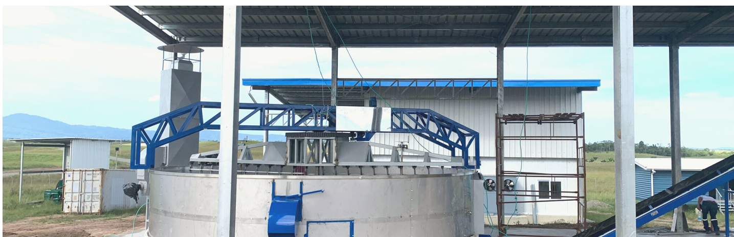
Solar cocoa dryer for premium quality and downstream cocoa processing, Sepik Plains, Yangoru Saussia District