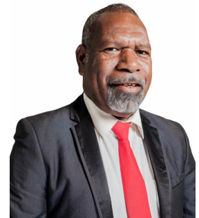
Sydor Utaeo GULF PROVINCIAL