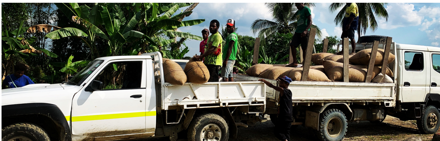
A local transport SME loading cocoa bags, East Yangoru

Together, we can, through partnerships and shared-responsibility.